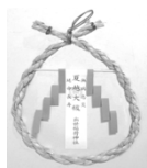
ミニ茅の輪 Mini Chinowa Approx. 6 inches (15cm)

Dear international participant(s), we kindly ask that you cover shipping costs for your plan ( hitogata plan excluded). Thank you for your understanding. Please note that local customs regulations may prohibit the shipping of Chinowa and rice to some countries.