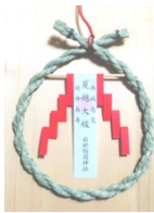
ミニ茅の輪 Mini Chinowa Appox. 6 inches