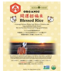
開運招福米 Blessed Rice 1lb. (454g)