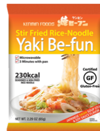
Yaki Be-fun 2.29oz. (65g)