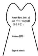
ペット形代 (かたしろ) Katashiro for pet