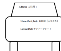
車両形代 (かたしろ) Katashiro for Vehicle