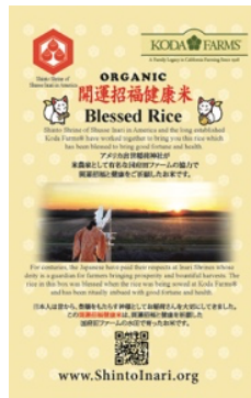
Blessed Rice 11lb. (454g)