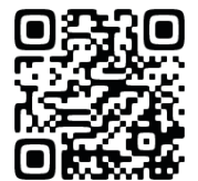
Ceremony fee donation QR Code