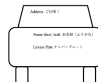
車両形代 (かたしろ) Katashiro for Vehicle