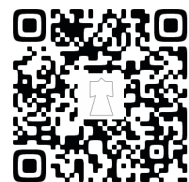
Application Form QR Code