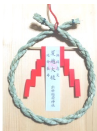
ミニ茅の輪 Mini Chinowa Appox. 6 inches