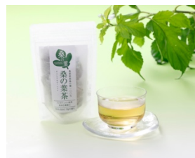
Blessed Tea Bags (Actual product may vary)