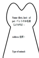
ペット形代 (かたしろ) Katashiro for pet