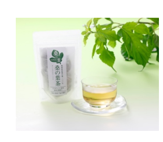
Blessed Tea Bags (Actual product may vary)