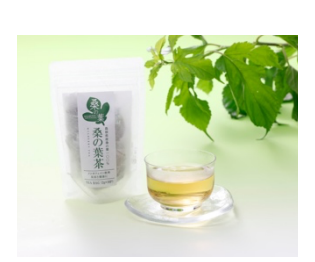
Blessed Tea Bags