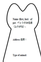
ペット形代 (かたしろ) Katashiro for pet