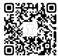
Application Form QR Code