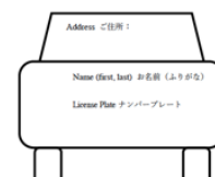
車両形代 (かたしろ) Katashiro for Vehicle