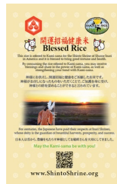
Blessed Rice 1lb. (454g)