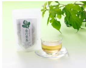
Blessed Tea Bags