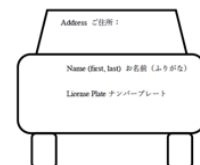
車両形代 (かたしろ) Katashiro for Vehicle