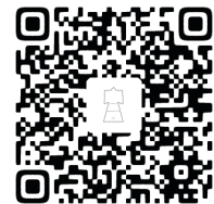
Application Form QR Code

Dear international participant(s) , we kindly ask that you cover shipping costs for your plan ( hitogata plan excluded). Thank you for your understanding. Please note that local customs regulations may prohibit the shipping of Chinowa and rice to some countries.