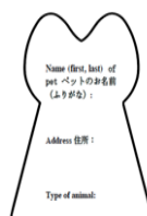
ペット形代 (かたしろ) Katashiro for pet