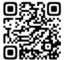
Ceremony fee donation QR Code